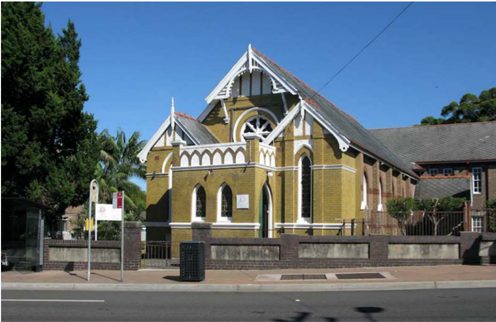
Figure 1: Rose Bay Methodist Church (1904) and the Wesley Hall (1929), (Source: RA Moore February 2018).

The site is located on the corner of Dover Road and Old South Head Road, Rose Bay, and its address is 518A Old South Head Road, consisting of Lot 37: Sec: A in DP 4567 (see Figure 1 & 2 below).