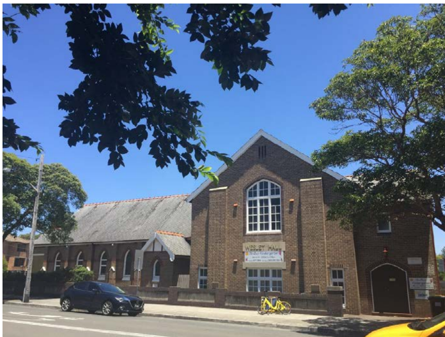
Figure 4: Wesley Hall and North elevation of Church from Dover Road