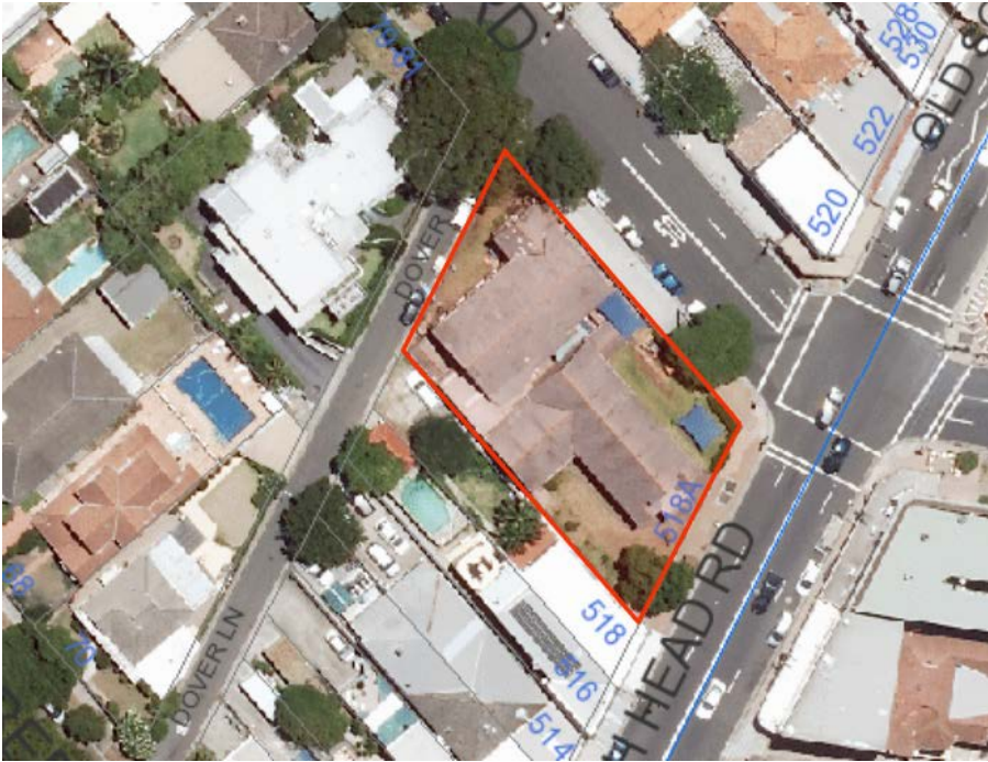
Figure 3: Aerial photograph showing the subject site outlined in red .

Church buildings occupy the majority of the site, with two small areas of lawn and landscaping on either side of the church building and a play area at the rear adjacent to the Hall (see the aerial image of the subject site in Figure 3). The complex is surrounded by a brick and roughcast fence fronting Old South Head Road and Dover Street, and a timber paling fence along Dover Lane and the South boundary. The subject site is not listed on the NSW State Heritage Register (SHR), nor is it included in Schedule 5: Environmental heritage of the Woollahra Local Environmental Plan 2014 (Woollahra LEP 2014). The site is not in the vicinity of a listed item.