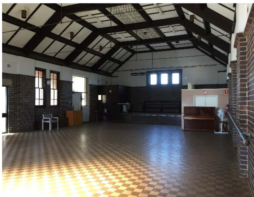
Figure 5: Interior, Wesley Hall, Rose Bay